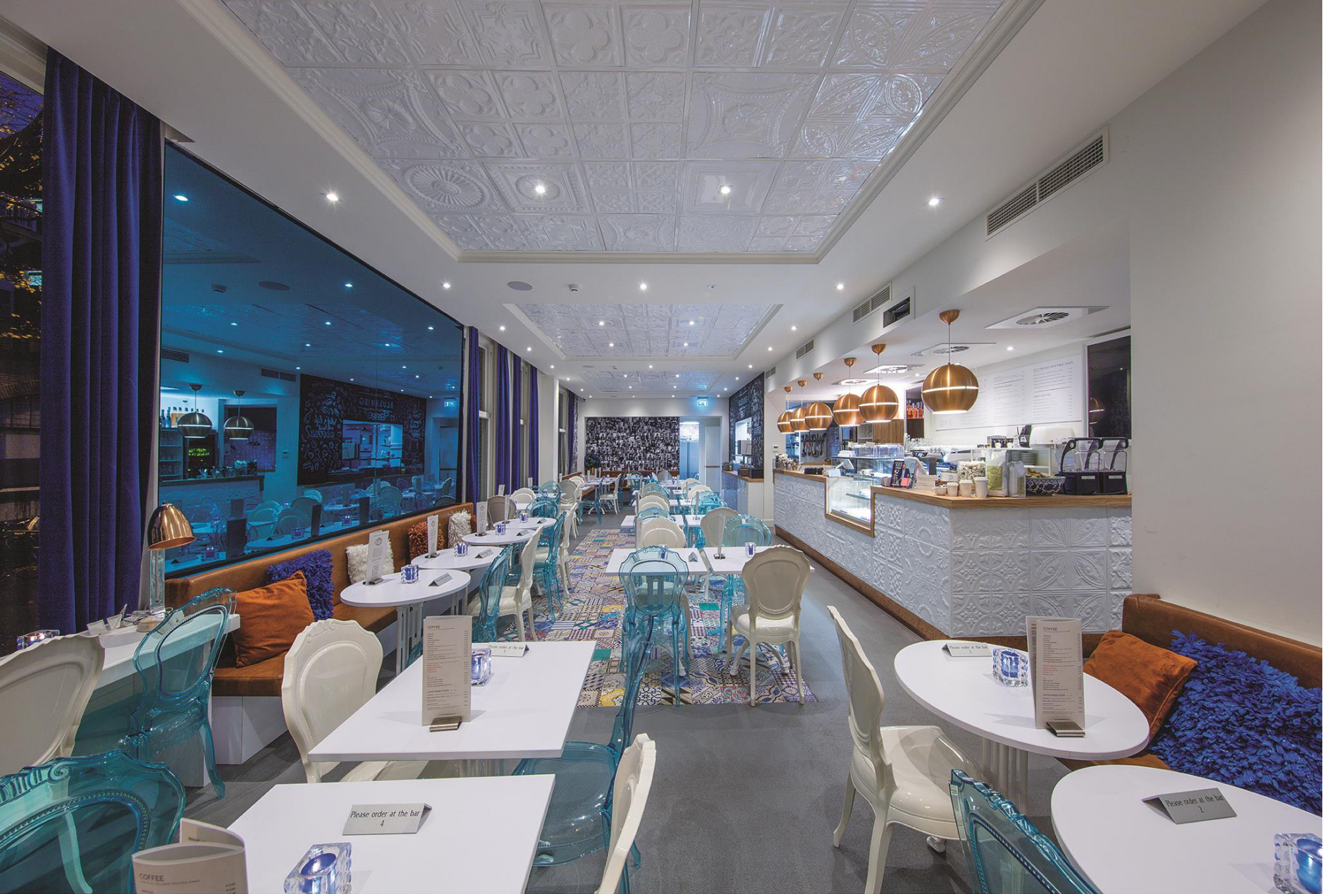
Ceiling, Accent Wall Restaurant