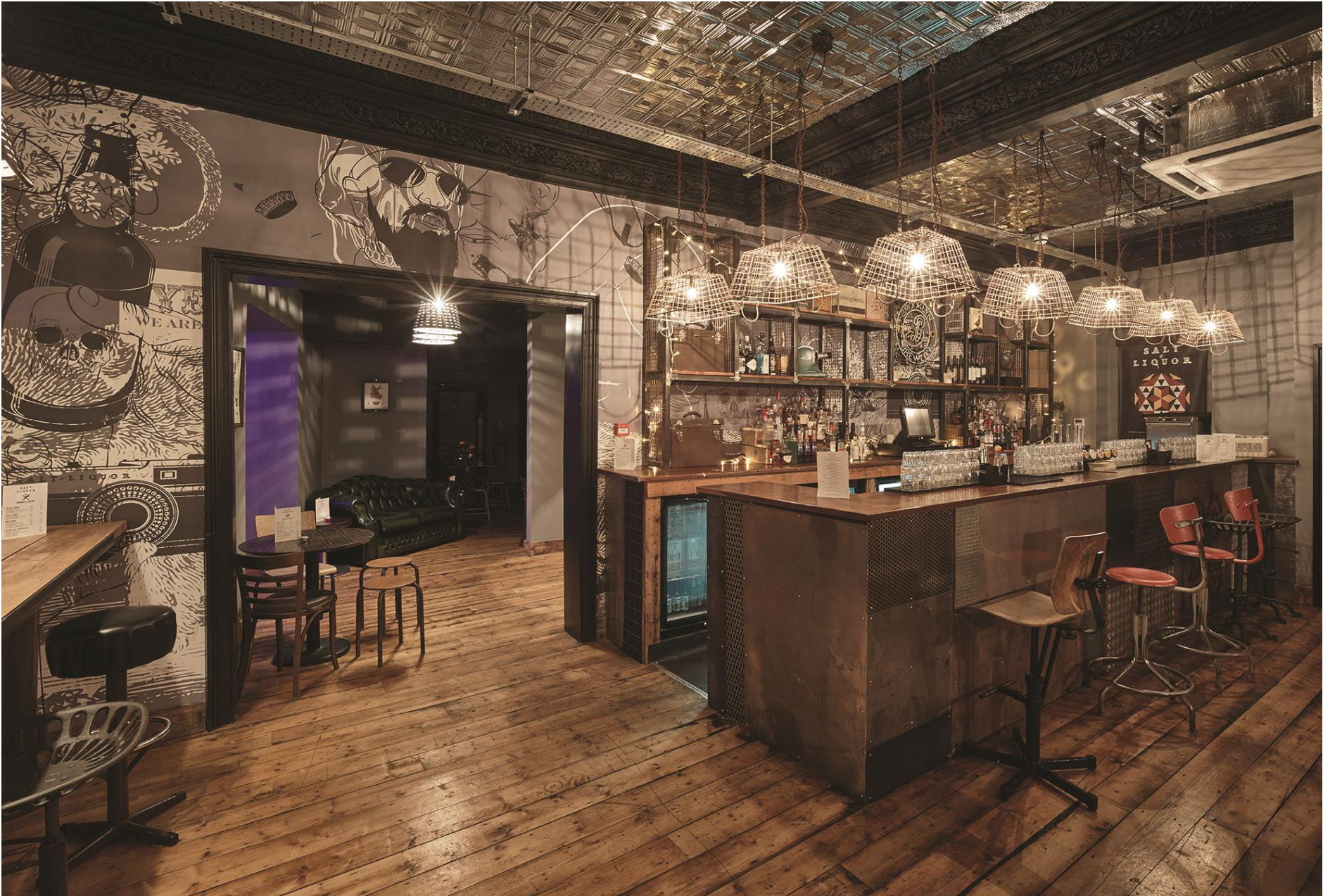
Ceiling | Bar